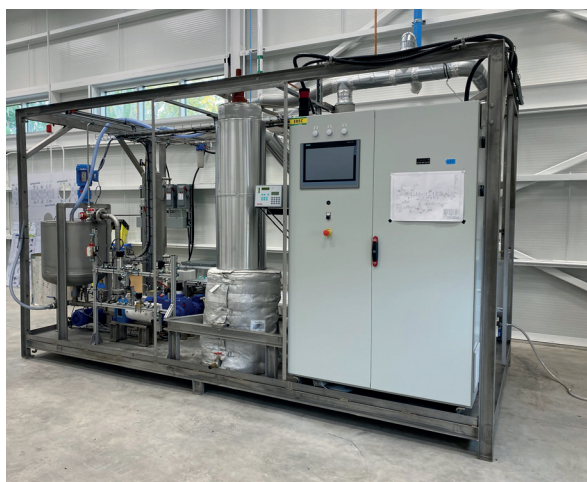
The hydrothermal oxidation pilot unit of the CTTEI

By enriching so-called subcritical or supercritical water with oxygen, a highly oxidising medium is obtained, capable of mineralising organic compounds rapidly, exothermically (by releasing energy) and generating water and carbon dioxide.